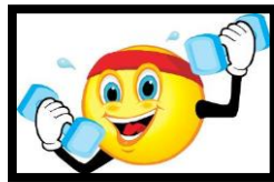
Building Worker Identity

It is common that those with mental health conditions think of themselves as a “ disabled person ” which often overshadows their identity as a successful employee . It is possible to develop a stronger worker identity before pursuing an actual job. If this is not an issue, the “preparing for work” step can often be skipped, allowing the job seeker to go directly to supported employment .